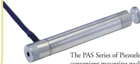
PAA009 Actuator with Included PAA001 Tip

The PAS Series of Piezoelectric Actuators provide a convenient mounting package with adjustment ranges of 20 mm, 40 mm, or 100 mm. Each actuator is shipped with a PAA001 flat tip, which adds 3 mm to the overall length of the actuator when attached. The tip can be removed and replaced with a PAA005 ball tip (see below). The TPZ001 or MDT694A are both ideal controllers to drive the PAS-series of actuators (see pages 636 – 637 and 640).