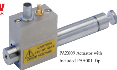
PAZ009 Actuator with Included PAA001 Tip